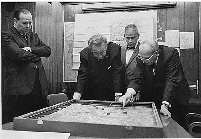
Figure 3: Situation Room: Walt Rostow shows President Lyndon B. Johnson a model of the Khe Sanh area, 02/15/1968

Similar to the “situation room” in the US white house where all intelligence matters are discussed concerning national security and which is used to monitor and deal with crises, companies should gather key customer information centrally and keep executive sales managers and company management informed in case of critical developments. This will enforce company wide sensitivity to important customer developments and enable faster decision making if required.