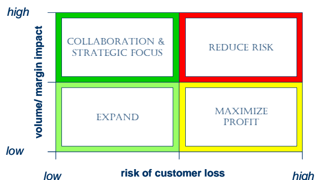
Figure 2: Customer classification matrix in a downturn according to customer risk

Segmentation of customers takes a whole new meaning within the current economic environment. In times of crisis it is required to segment against different criteria than during "normal" times. Volume and profitability need to be assessed against the risk of loss and against the likelihood of survival in the mid term / long term. The following table illustrates segmentation requirements of customers in a downturn with respect to risk. The cumulated volumes and margins in each quadrant will then help determine the required measures.