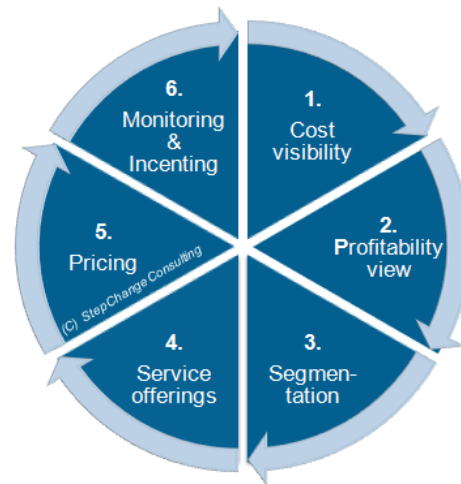
Figure 3: StepChange Margin Wheel

The StepChange Margin Wheel below demonstrates the elements that need to be covered in order to arrive at a successful pricing and margin management. It does not show the organizational adjustments necessary to sustainably implement the elements.